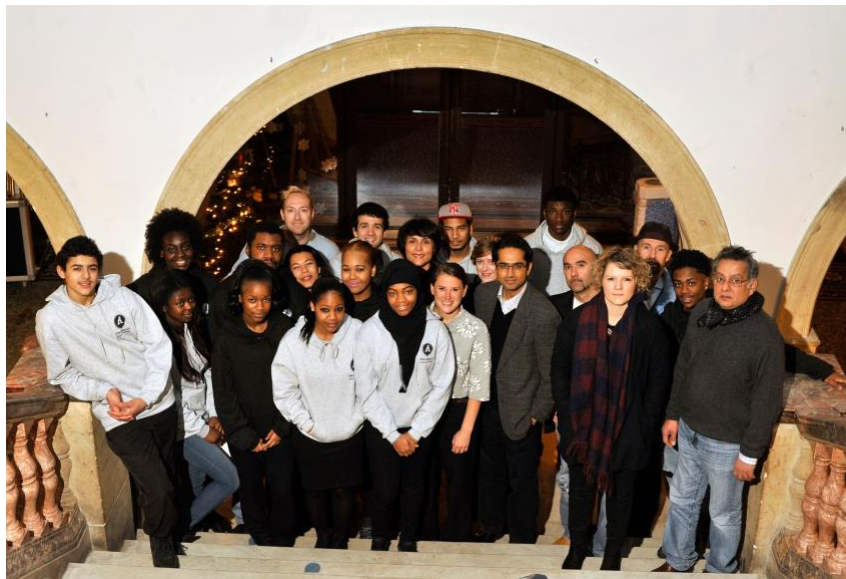
Agents gathered at Battersea Arts Centre 2017