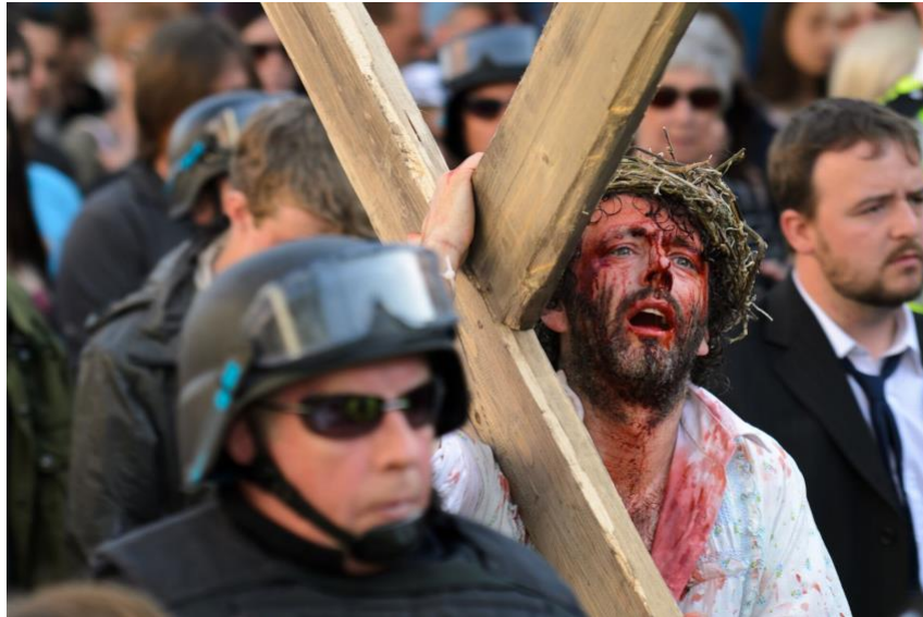
Michael Sheen in NTW and WildWorks' The Port Talbot Passion

that perhaps describes this was WildWorks' The Port Talbot Passion in 2011 that brought together former resident and Hollywood star Michael Sheen, a cast of over 1000 community volunteers, and hundreds of artists and creative practitioners to retell the story of The Passion in one of Wales' most overlooked communities.