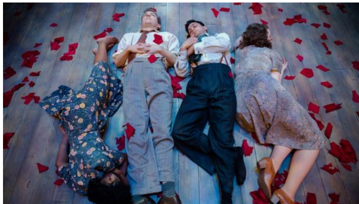
The RSC's 2016 production of A Midsummer Night's Dream toured the UK blending amateur and professional coasts

While this idea tended to dominate the world of cultural policy and arts administration there was always room for a parallel world of amateur and participatory arts. This would include church choirs, am-dram societies meeting in village halls, knitting circles, book groups, classes at the Workers Educational Association or University of the Third Age.