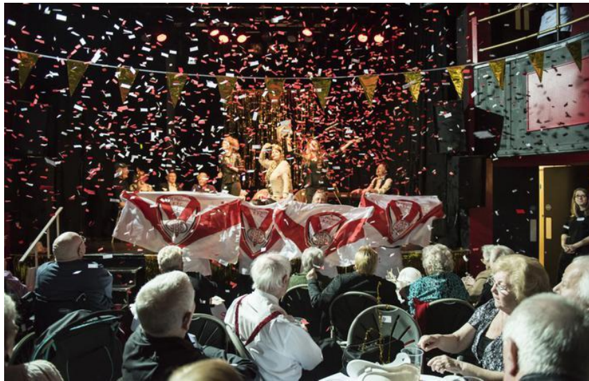
A Right Knees Up – Heart of Glass

Rupture: a coaching support programme for early career artists directly engaged in, or passionate about, socially engaged practice.